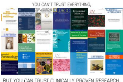
BUT YOU CAN TRUST CLINICALLY PROVEN RESEARCH.

With the cold and flu season so quickly approaching, what concerns do you have for your family?